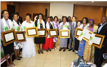
Ministers receiving WFWP CI's charter