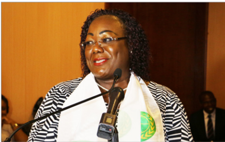
Minister of Environmental Safety and Sustainable Development