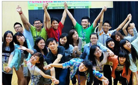
Youth Leaders Empowerment Camp co-organized with National Taiwan Normal University