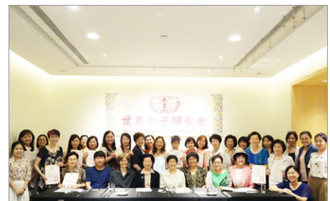
WFWP Taiwan board members