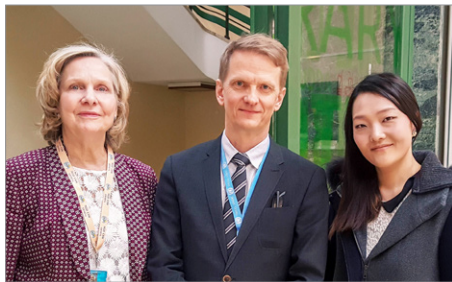
(center) Perm. Rep. of Iceland to the UN at Geneva

March 26, 2018 - United Nations Library, UN Office at Geneva