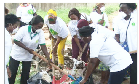
Cleanup service project at Abobo Town Hall