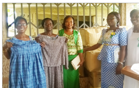
WFWP CI clothing drive