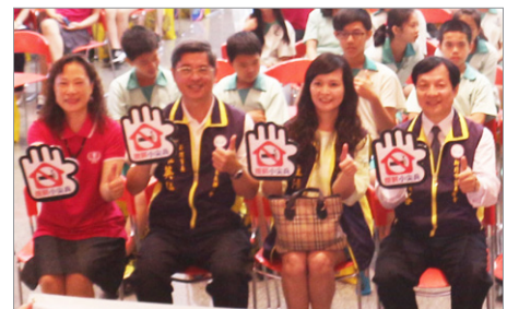
Anti-Smoking Campaign press conference and awards ceremony co-organized with New Taipei City