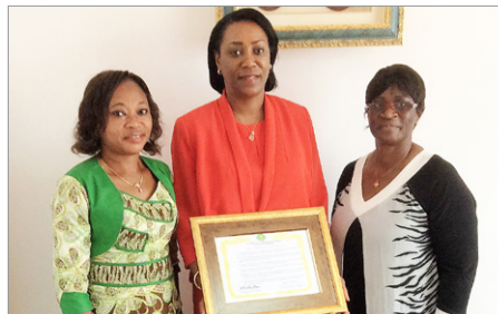
(center) Ms. Ahoussou, wife of the Minister of State