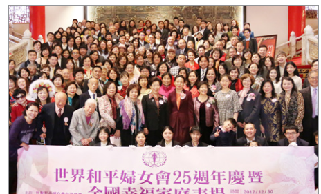
WFWP's 25th Anniversary Celebration & Happy Family Awards Ceremony in Taipei