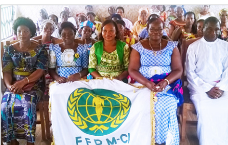
Associations who received donations from WFWP CI