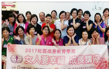
Happiness Family Empowerment Program at Taoyuan WFWP Service Center