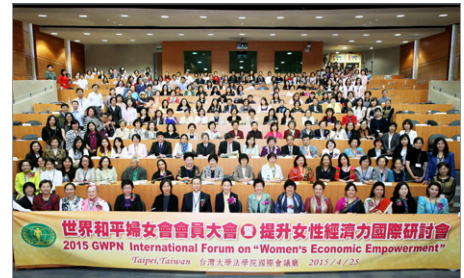
International Forum on Women's Economic Empowerment