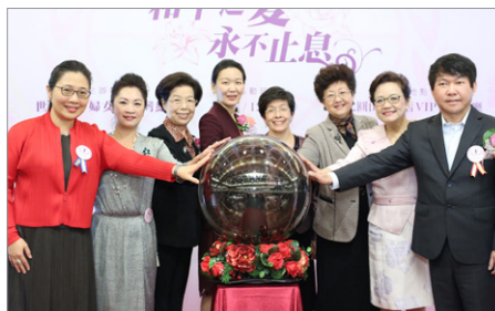
Launch of WFWP Taiwan's Innovative Development Plans of 2018