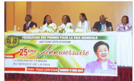
WFWP CI 25th Anniversary Celebration