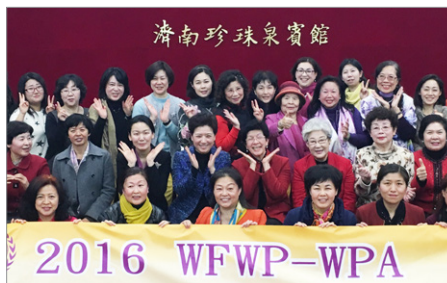
Service project at a children's home in Confucius' hometown in Shandong Province, China