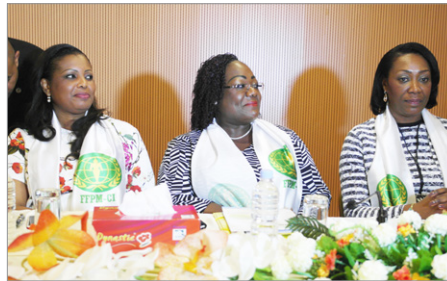
Minister and wives of ministers attending WFWP CI event