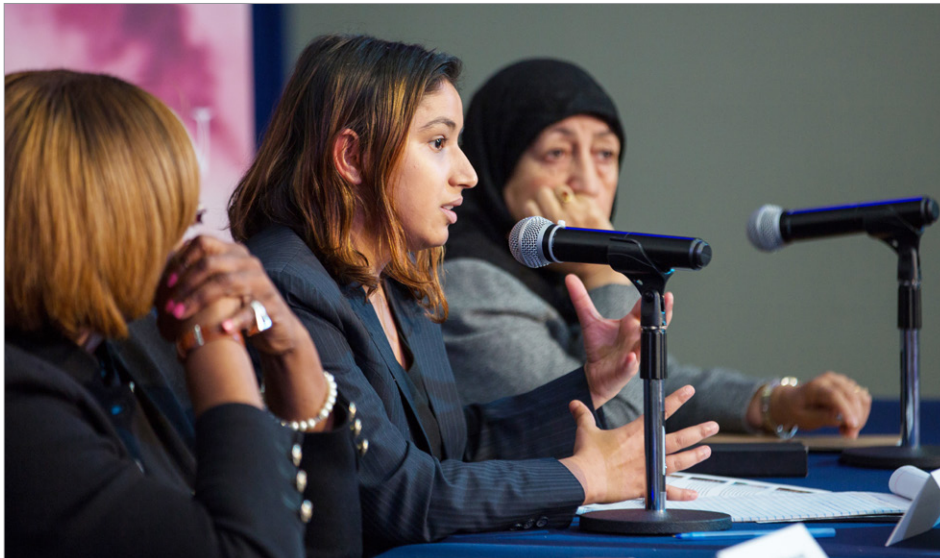
Panel discussion on peace leadership at the 2018 Horizon Summit