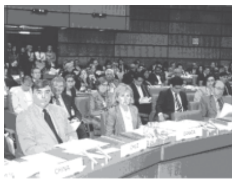
Adoption of the agenda and organization of work of the UN Office on Drugs and Crime.